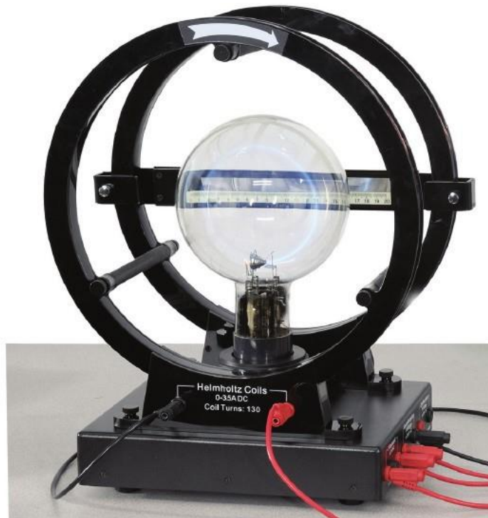
Figure 1: Photo of the e/m measurement apparatus similar to used here. A ruler behind the glass bulb helps measure the electron beam radius ( r ).

The split-mode DC power supply has two outputs that produce low-voltage and relatively high current. An output is connected to the Helmholtz coils. The other power supply has high-voltage and low current that sets the electron kinetic energy eV , and high current AC power that heats the filament of the apparatus.